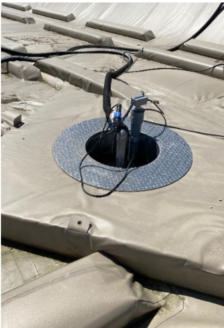
Figure 4. Rainwater Removal System

The rainwater removal system was designed for a 10-year, 24-hour duration and 25-year, 24-hour duration storm event. The number and size of the rainwater removal system pumps was based on a 48-hour and 72-hour removal capacity. Each cell has five submersible sump pumps housed in perforated aluminum sump cans located in the rainwater collection troughs. The surface water is pumped to the top of reservoir perimeter and discharge into pipes located outboard of the perimeter parapet wall. Figure 4 shows one of the aluminum sump cans located in the east reservoir cell. Figures 5 – 10 show additional installation and inflating testing performed during phase 2 on the west cell.