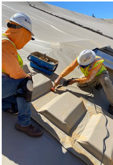
Figure 5 and 6. Crews installing fabricated entry stairways and welding floating cover seams