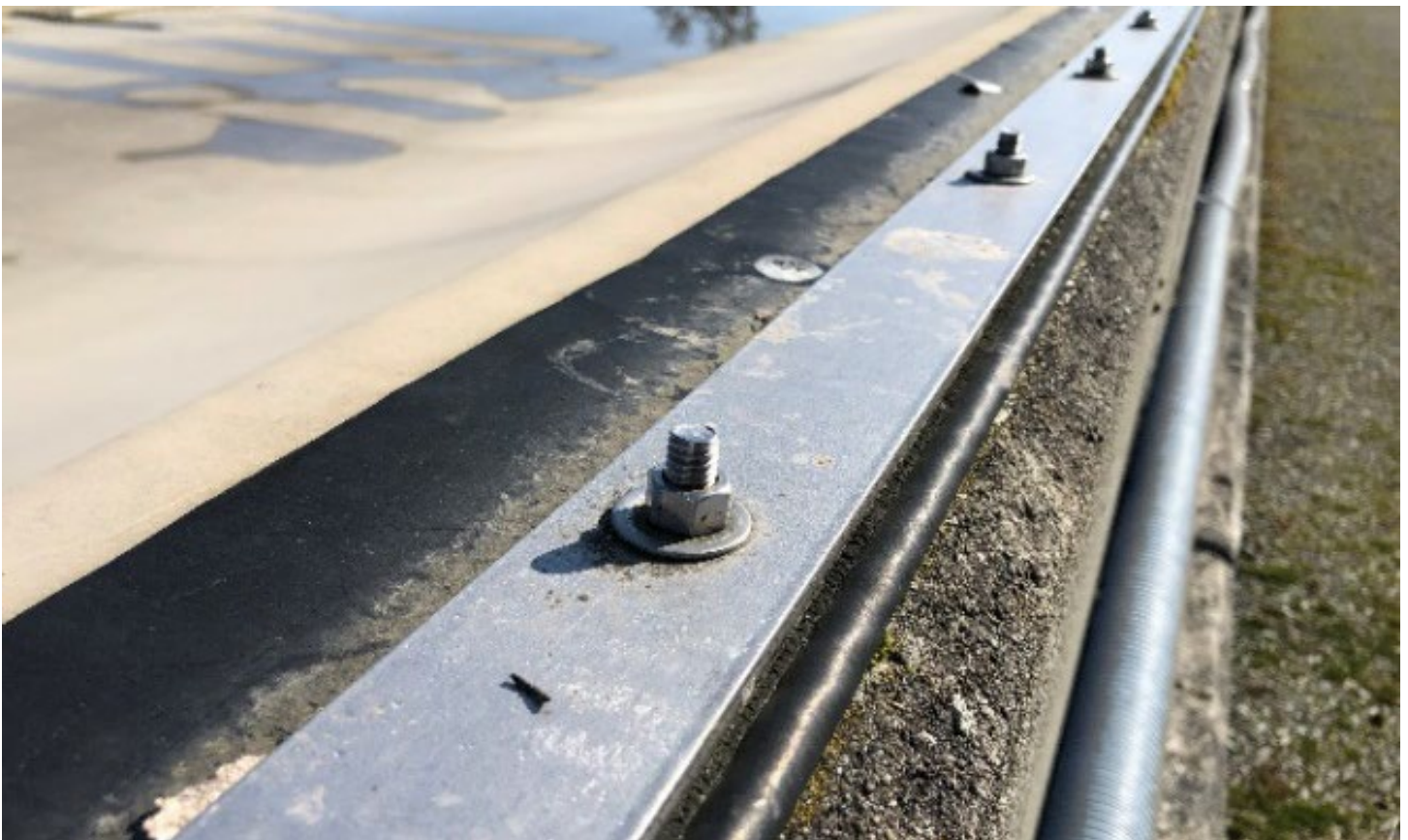
Figure 10. Floating cover mechanical anchorage at parapet wall