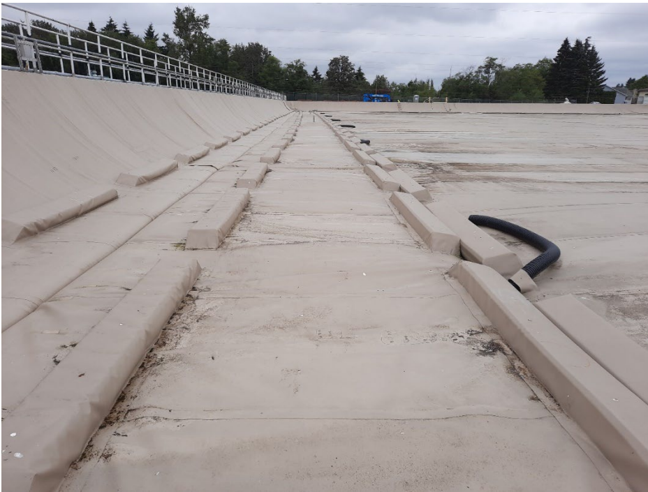
Figure 3. East cell divider wall trough in full service

The rainwater removal system was designed for a 10-year, 24-hour duration and 25-year, 24-hour duration storm event. The number and size of the rainwater removal system pumps was based on a 48-hour and 72-hour removal capacity. Each cell has five submersible sump pumps housed in perforated aluminum sump cans located in the rainwater collection troughs. The surface water is pumped to the top of reservoir perimeter and discharge into pipes located outboard of the perimeter parapet wall. Figure 4 shows one of the aluminum sump cans located in the east reservoir cell. Figures 5 – 10 show additional installation and inflating testing performed during phase 2 on the west cell.