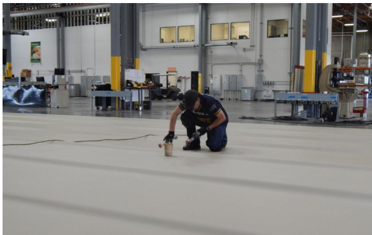
Figure 11. Factory fabrication of CSPE panels in our Lakeside, CA Plant

The Lake Forest reservoir required substantial prefabrication of the geomembrane liner, floating cover, and appurtenances. The project required approximately 850,000 ft 2 (79,000 m 2 ) of prefabricated geomembrane panels. This included a large amount of custom size fabricated panels to address the divider wall and various curves and slopes of the reservoir. In total the project required close to 120 days of equivalent plant fabrication time. The prefabrication of the geomembrane liner, cover and components resulted in substantial reduction in the amount of required field welding, construction time and installation cost. This was also important considering the highly inclement weather conditions typically experienced in the Seattle and Puget Sound region of Western Washington.