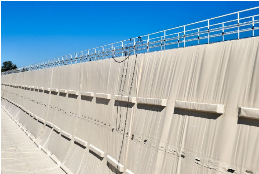
Figure 2. Installation underway of double trough system on 28-foot divider wall on west cell

The construction challenges included developing a revised floating cover design and installation to address the issues with the 28-foot high vertical divider wall as well as mechanically attached to the perimeter concrete parapet wall. To address the vertical wall configuration and shape of the reservoir, the design engineer selected a weighted tension cover system. This system uses a series of designed troughs in conjunction with surface floats and ballast weights to supply the required cover tensioning, buoyancy in the floating cover, and create rainwater collection troughs to drain surface water adjacent to the vertical divider wall. To handle the additional material slack developed in the floating cover from the 28-foot high vertical divider wall during the different reservoir