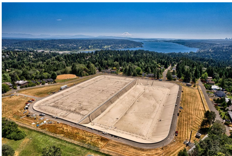
Figure 1. Aerial view of the completed east cell (left side) completed in 2021 and west cell (right side) reservoir under construction in July 2022