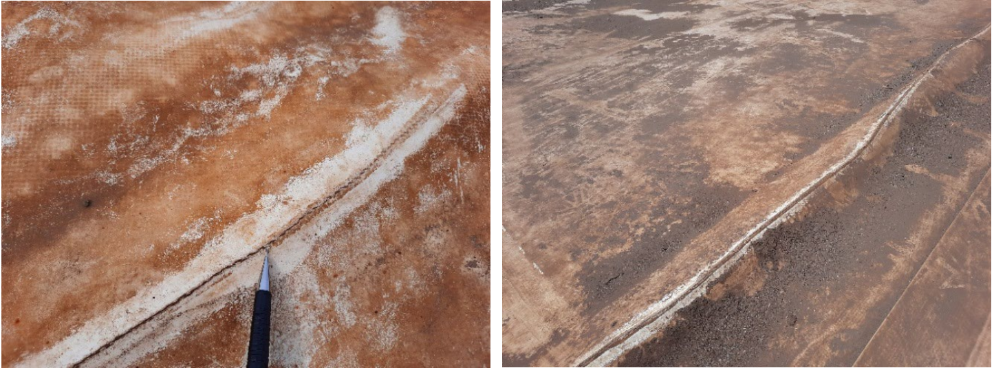
Figure 12 & 13. Surface cracks found in the RPP liner material folds and creases.

disinfectants. The CSPE geomembrane material is also noted to have excellent UV resistance and backed by a 30 year weathering warranty.