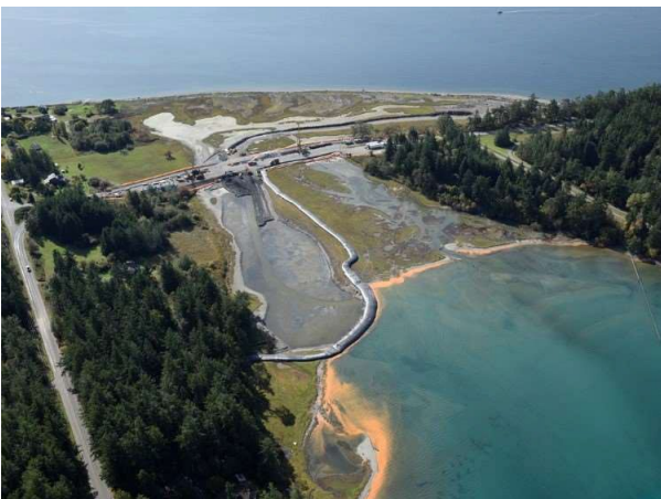
Figure 8. Aerial view of completed Kilisut Cofferdam installation.

The project faced a number of unique challenges. One of the main challenges was working in tidal conditions which required the installation of the dams to only take place during low tide cycles. The contractor was also not allowed to operate equipment on the majority of the site in order to protect the pickle grass and wetlands area. This required many of the dams to be unrolled and positioned manually. With the multiple size dams, special fabricated collars were manufactured to connect the different sizes on site.