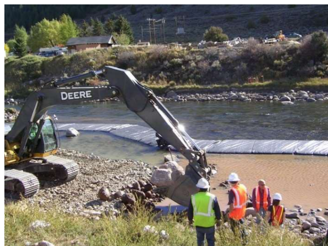
Figure 1. Installation of 6' Cofferdams - Eagle River, CO

Geosynthetic cofferdams are increasingly utilized for civil construction applications including dewatering, flood control and sediment control. This paper describes one of the more commonly used geosynthetic dam system which was developed in the early 1990's and has been used extensively in North America as a portable cofferdam. It is a water control structure designed to source water directly from the stream, river or pond to control, contain and divert the flow of water. It is used in applications such as dewatering for bridge foundation work, dam repair, pipeline crossing, canal liner repair and shoreline construction and restoration. Geosynthetic dams provide an economical and modular alternative to conventional construction of earth dikes and mechanical sheet piling in these applications.