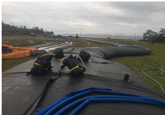
Figure 6. Kilisut Cofferdams being deployed in low tide

In 2019, the North Olympic Salmon Coalition and the Washington State Department of Transportation needed to restore the historic tidal channels and fish runs between southern Kilisut Harbor and Oak Bay in Jefferson, County Washington. This included removing the outdated culverts and installing a new elevated bridge which replaced a causeway as part of creating 2,300 acres of productive fish habitat in the Puget Sound region. The first phase of this project included restoration of the channel on the north side of the highway in a sensitive marine environment. Figure 6 shows the cofferdams being deployed during tide out conditions.