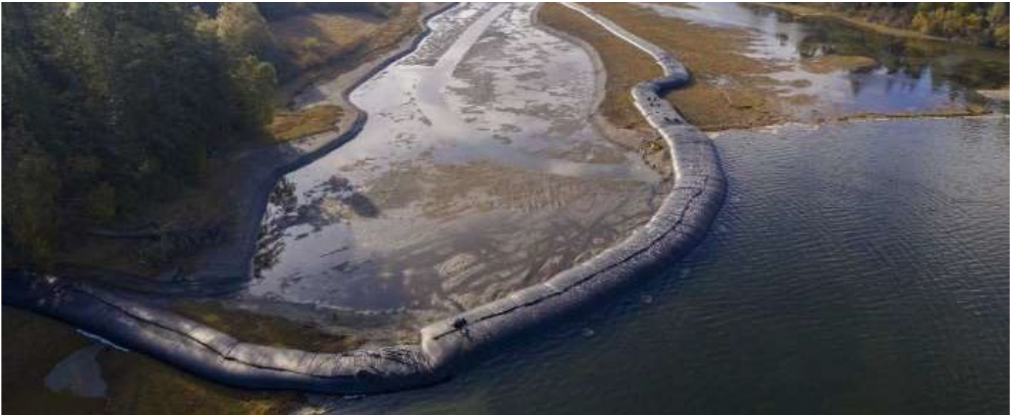
Figure 7. Kilisut Harbor Cofferdams

and contractor chose a temporary portable coffer dam. Layfield USA Corporation's modular cofferdam system was chosen for the project. The project scope including the manufacturing and installation support of 1,400 feet (427 m) of multiple sizes dams in sizes of 4', 6', 8', and 12' (1.22, 1.83, 2.44, 3.66 m) in heights. The installation started in September 2019 with a crew of seven field technicians.