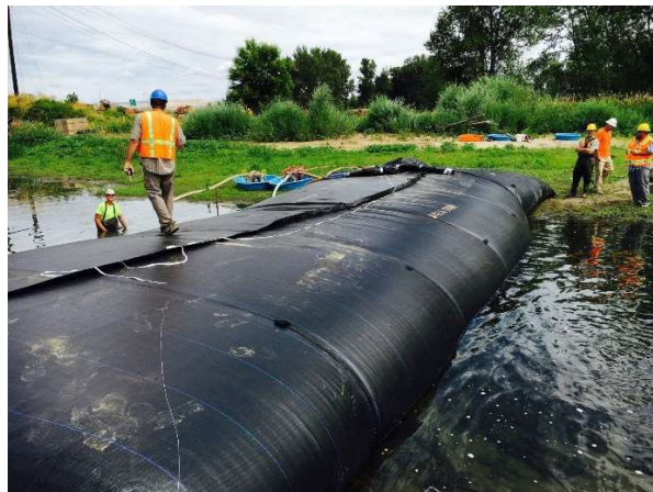
Figure 9. 8' Cofferdams being installed - Toppenish, WA