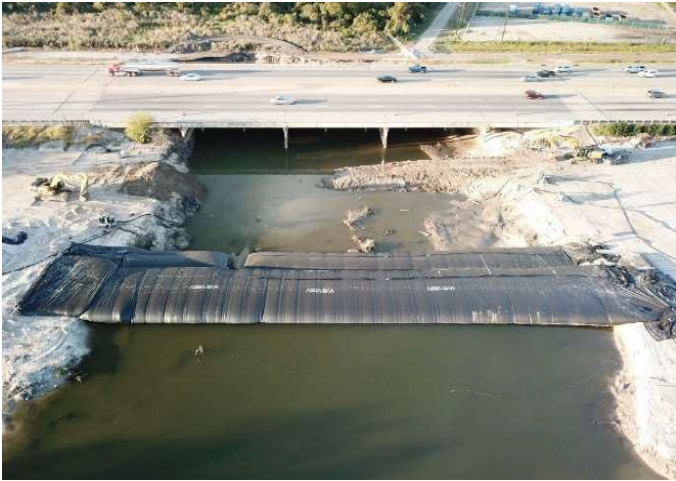
Figure 2. USACE 10' & 8' Cofferdam - Baytown, TX

steel structures consisting of sheet piles, wales or cross braces and are normally dismantled after construction. However new portable or temporary geosynthetic cofferdam systems provide an effective alternative. These systems come in a variety of different designs, materials and installation methods and provide a more economical solution for temporary site dewatering versus conventional structural cofferdams. Portable geosynthetic cofferdams are typically lighter weight modular systems produced from geomembrane and geotextile fabrics. They limit the impact of construction generated silt and sedimentation when excavating in submerged or dredging areas, which lessens the environmental impact. Most systems are also modular in design allowing for bends and turns in the project waterway. They can also be installed and removed quicker than standard structural cofferdams