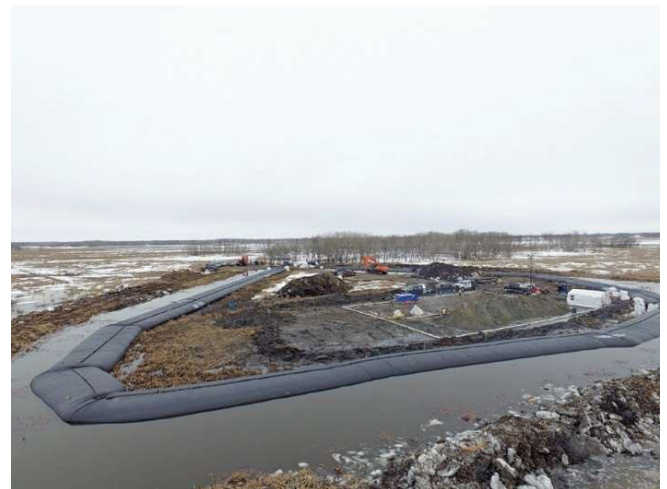
Figure 3. 6' Geosynthetic cofferdams for pipeline repair in Manitoba, Canada

For this paper, the cofferdam system produced by the manufacturer consists of two geomembrane tubes contained by a high strength woven textile outer tube. The two inner tubes are filled with water which creates a stable, non-rolling water-controlled structure. A center baffle curtain is installed for stability, reducing movement or tipping as a result of hydrodynamic loading. The local water source is normally used to fill the inner tubes of the dam. This cofferdam dam system was first introduced in the early 1990's and is constructed in a range of sizes from 4' diameter to 16' diameter in standard 100' and 200' lengths. Special connecting collars are used to join the dams during installation. Standard fill and drain ports are installed into each dam. Installation of the dams requires trained technicians and equipment and can be far more difficult in moving water applications versus slow or still water projects. Special patch kits and repair techniques are used in the event the dams are punctured during the installation or in application. Figure 3 below shows the modular capabilities of the portable cofferdams.