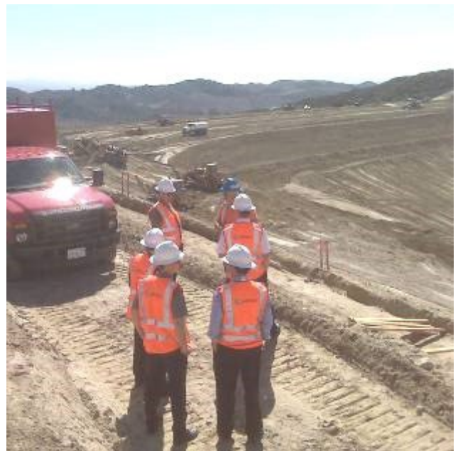
Figure 2. Site visit during the construction of the dam.

A geosynthetic underdrain was placed as the first layer of material underneath the entire reservoir. This underdrain was placed to monitor the performance of the lining system and to provide drainage during construction. The underdrain also provided drainage