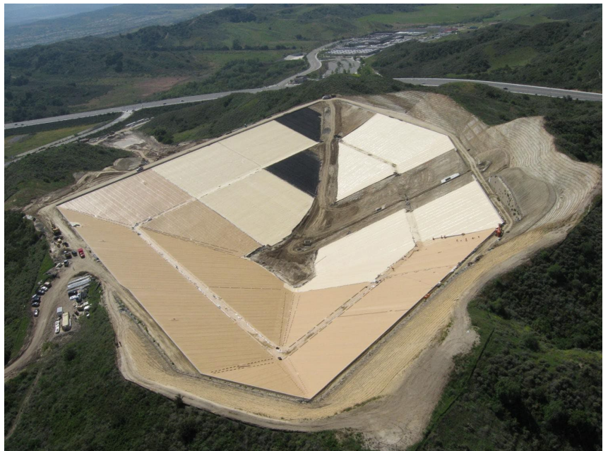
Figure 1. Aerial view of the Upper Chiquita Reservoir under construction.

All domestic water supplied to the SMWD has to be purchased from outside sources as there are no local water sources. Most of the region's water is piped from the Diemer Filtration Plant in Yorba Linda. In the past few years the district has experienced major supply disruptions with the