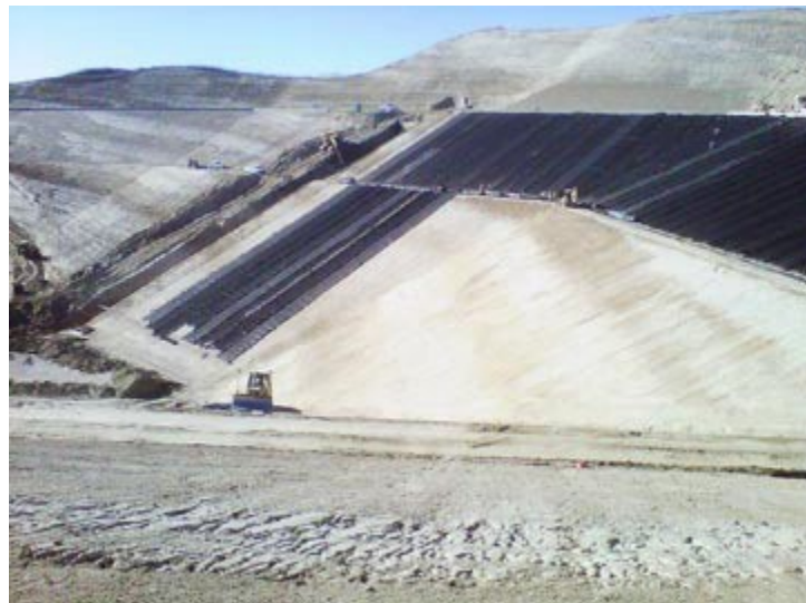
Figure 3. Placement of the geocomposite underdrain.

The original specification for the primary geosynthetic barrier system (geomembrane) called for the use of a three-ply 60 mil (1.5mm) Chlorosulphonated Polyethylene (CSPE) geomembrane. During the time of construction there were challenges in the supply of CSPE materials and the lining was changed to a flexible polypropylene material in order to get both the lining and the cover materials delivered on time. The final liner material selected was a 60 mil (1.5mm) thick three-ply fabric-reinforced flexible polypropylene geomembrane (fRPP).