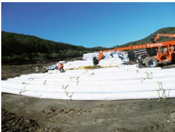
Figure 4. 36' Wide prefabricated liner panels

The fRPP materials for the liner were prefabricated prior to installation according to a detailed panel layout. All seams were welded using a 3" wide wedge welder that bonded the materials together edge to edge without leaving a flap of material at the seams. In order to reduce creases in the lining material the fabricator on this project used a 36' wide winder to create rolls of fabricated materials that did not require any folds in the material. There is some thought that creases in fRPP materials can lead to stress concentrations that can initiate failures. This is especially problematic in thicker materials such as a 60 mil material. By fabricating without folds this particular fabricator was eliminating this area of potential problems.