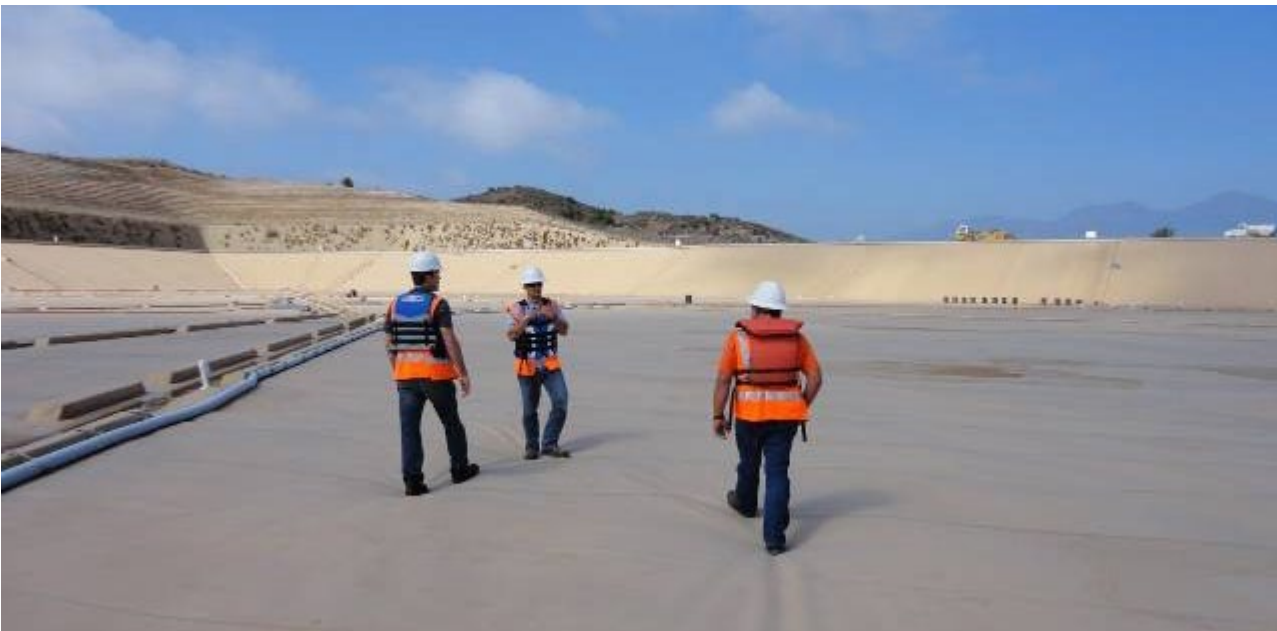
Figure 8. The upper Chiquita Water Reservoir of the Santa Margarita Water District, filled and in service.

Since the repair the leakage rate fallen to between 9 and 10 gallons per minute which is within the design limits for a project of this size.