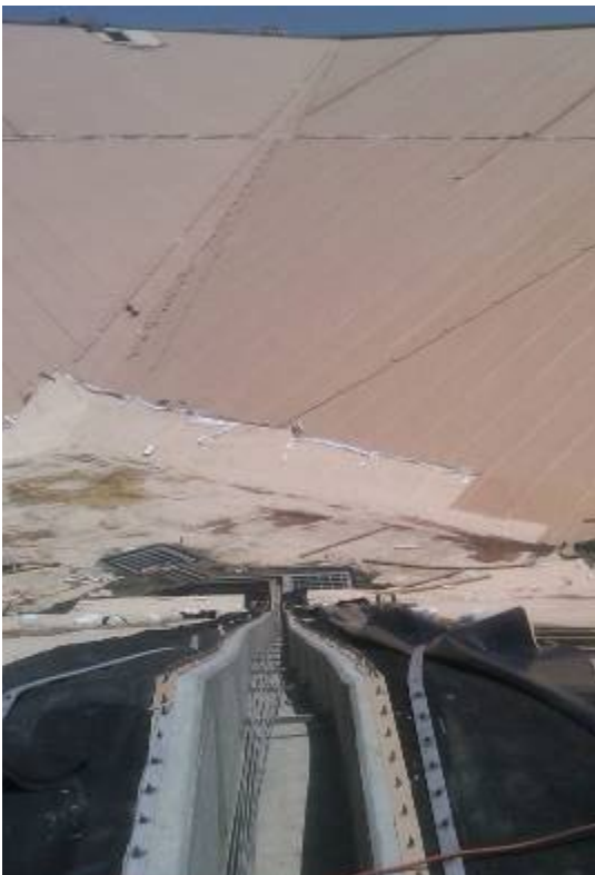
Figure 7. Pneumatic tubing in concrete trough

Finally, after many weather delays and significant effort in repairs the liner and cover were complete. The reservoir went into service in October 2011.