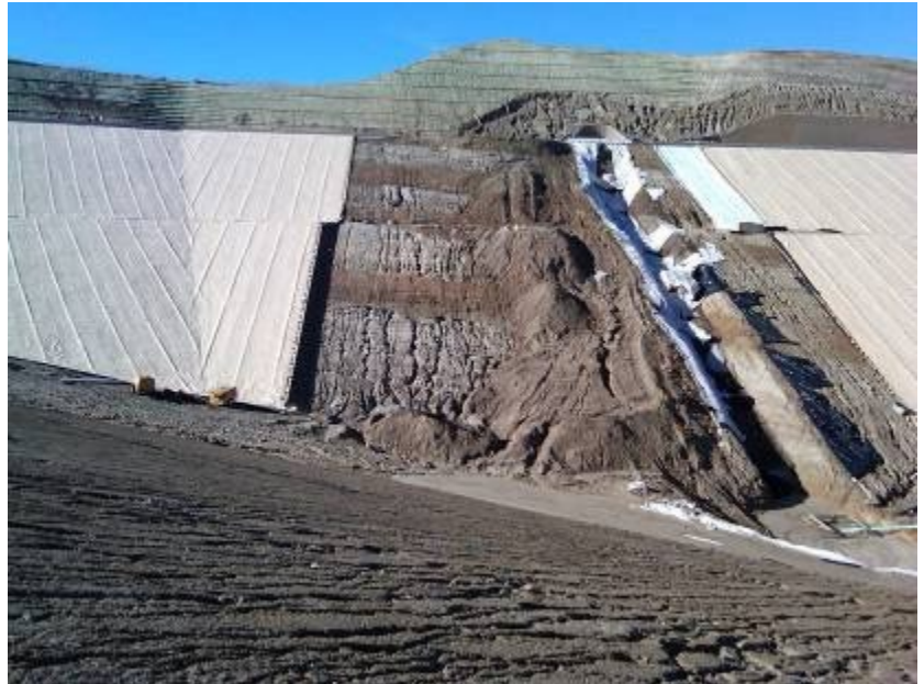
Figure 6. Subgrade damage after a significant rainfall event.

The construction of the reservoir started in the summer of 2009 and progressed well until the winter of that year. The winter of 2009/2010 was very rainy and there were many project delays. The large volumes of water kept the base of the reservoir very wet so that the earthworks could not be completed and the lining could not cover the base of the reservoir. The winter of 2010/2011 was even wetter with one particular week seeing over 10 inches of rain. "The rain gauges overflowed three days in a row" said Bart Lantz, project manager for SMWD. This rain event washed out a portion of the subgrade underneath the liner and a large section of liner had to be removed and the subgrade repaired. Over 200,000ft 2 of liner was pulled back to access this repair area. It took more than a month for the earthworks contractor to dry out the site after this rain event.