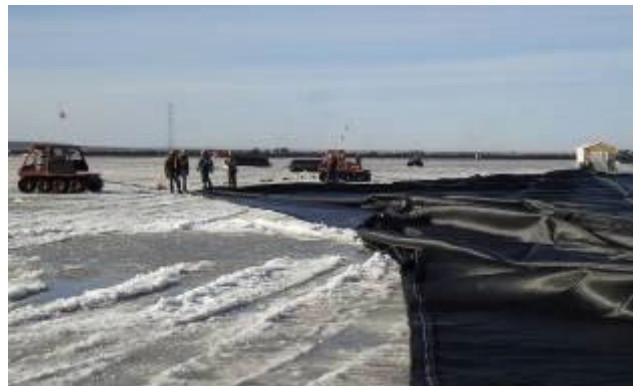
Figure 9. Deployment of a fabricated panel on the ice.

Installation began with the preparation of road tie-ins at the edge of the pond. These anchors used the 175 by 175 kN/m fabric so that cross seams and diagonal seams could be prepared. Most of these anchors had triangular sections so that the road would start out in the right direction. The panels were field cut and re-sewn to make anchors of the correct shape.