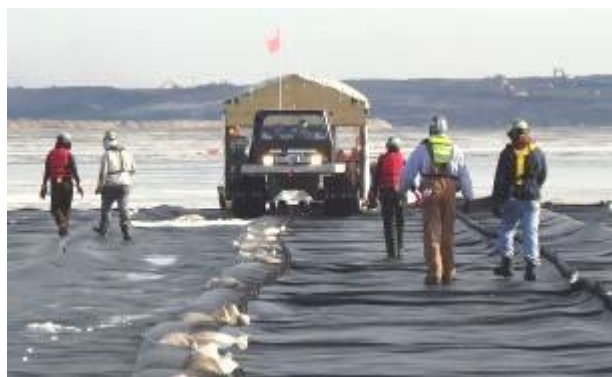
Figure 1. Preparing to sew a seam on the ice. Note the stockpile of coke in the background.

The Alberta oil sands deposits in Ft McMurray are one of the largest sources of oil in current development. Quantities of oil sand are retrieved through conventional mining and then washed to retrieve the desired oil. Bitumen is recovered through the Clark Hot Water Extraction process, with the residual sand, fines and water transferred to tailings ponds for settling and future reclamation. The fines, consisting of clays, silts, and some residual bitumen, are partially trapped within the sand beaches with the remainder transported into the water column of the ponds. Much research has been done on oil sands tailings; however, the fines fraction has proven to be a persistent challenge with a predicted settling time of over 30 years (Wells, 2010).