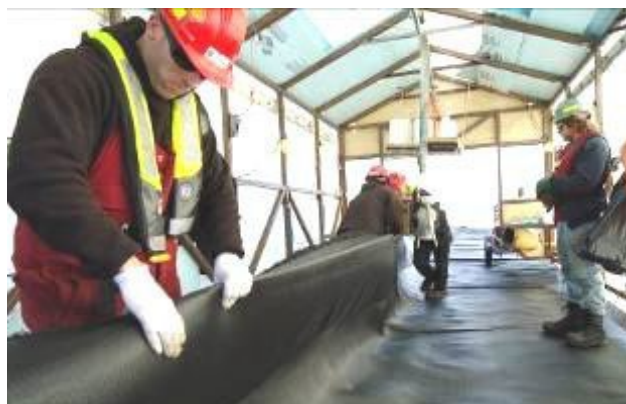
Figure 10. Field seams being sewn in the heated sewing trailer.

Once the anchors were in place the road construction began. It was determined quickly that the panels needed to be placed on the ice for most efficient installation. The restriction against movement on the ice was relaxed and placement proceeded swiftly. Placing the panels on the ice did not present any significant problems. Using amphibious vehicles to assist in pulling out the panels and a labor crew the panels were placed without difficulty. Fortunately, there were no significant snowfall events during field operations.