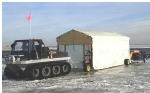
Figure 6. Completed Sewing Trailer.

The last problem with field sewing this geotextile was how to test the seams produced. Wide width geotextile seam testing equipment is not widely available (ASTM D4884-96, 2003). Seam test coupons from the site would have to be sent to a lab in either Quebec or Texas for testing. Ft McMurray does not have overnight courier service to these labs. If samples were sent out, then it would have taken about three days to receive results. At the proposed installation rate of 15,000 m 2 per day this would result in 45,000 m 2 of material exposed on the pond that couldn't be backfilled until test results were received. There was a concern that this might hold up coke placement.