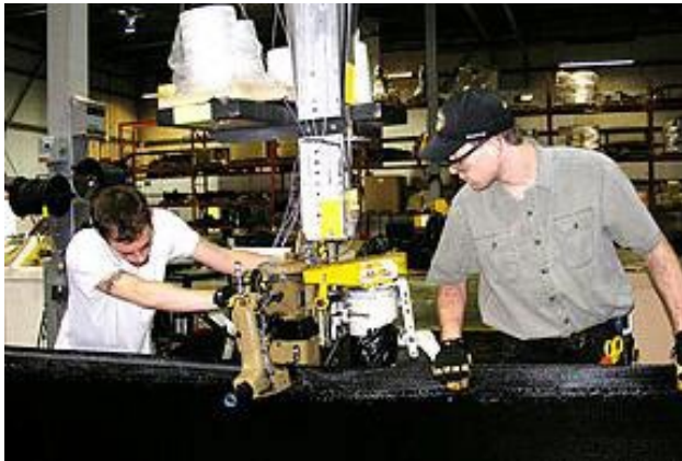
Figure 5. Shop Fabrication Sewing.

The new proposal for Pond 5 high strength woven geotextile road fabrics included 23 road crossings using the 175 by 175 kN/m fabric and the balance of the 13 kilometers of road with the newly developed 105 by 155 kN/m fabric. This change in fabric meant that the project seaming requirement of 82.5 kN/m could be met in both directions while reducing the cost and the weight of materials substantially. This change saved $3,263,000 in direct material costs and a further $130,000 in fabrication fees. It also