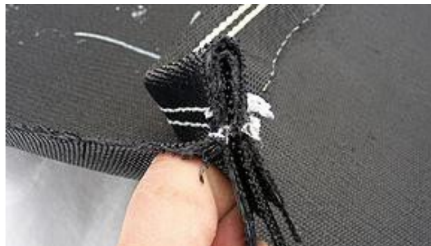
Figure 7. J-Seam Stitch Type.

That left two aspects of sewing that could be controlled. The first was stitch density and the second was the distance of the seam from the folded edge of the fabric. The sewing machines in use had a variation in stitch density of between 3 and 6 stitches per 25 mm. Work initially focused on stitch density. Since the 105 by 155 kN/m fabric was quite slippery it was found that the material