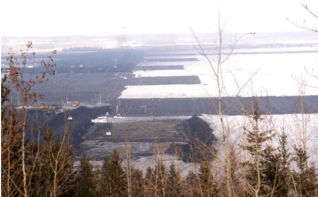
Figure 12. Extent of roads at the end of construction in winter of 2010.

There were several important things learned on this project. The first and most important was that placement and sewing of high strength woven geotextile could take place safely on the ice of a frozen tailings pond. The placement and sewing were difficult in poor weather but, with the use of heated sewing trailers, produced seams that met the project specifications fully. The second was that the deployment and seaming of the geotextile was not the bottleneck that was originally anticipated. Large, prefabricated panels (100 by 22.5m) moved most of the seaming off the ice and into the fabrication shop which reduced the field seaming to a minimum.