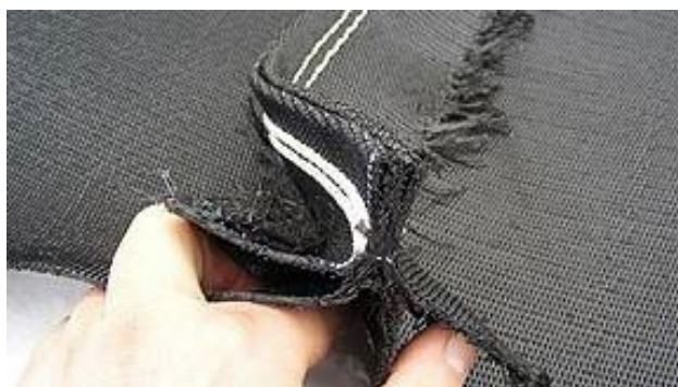
Figure 8. Butterfly Stitch Type.