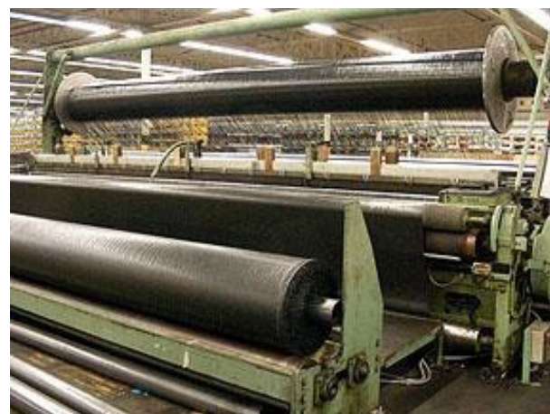
Figure 4. High Strength woven geotextile loom that can make geotextiles with stacked tapes.