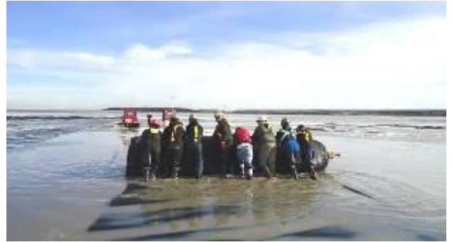
Figure 11. Last few panels placed before spring melting stopped on-ice activities.

An interesting aspect of this job was how fast everything happened. Because this project took place in the winter there were considerable resources available for manufacturing, fabrication, and installation of the geotextile. This project could not have achieved the same turn-around times or rates of production in a summer installation. In this wintertime frame all resources needed were available on short notice.